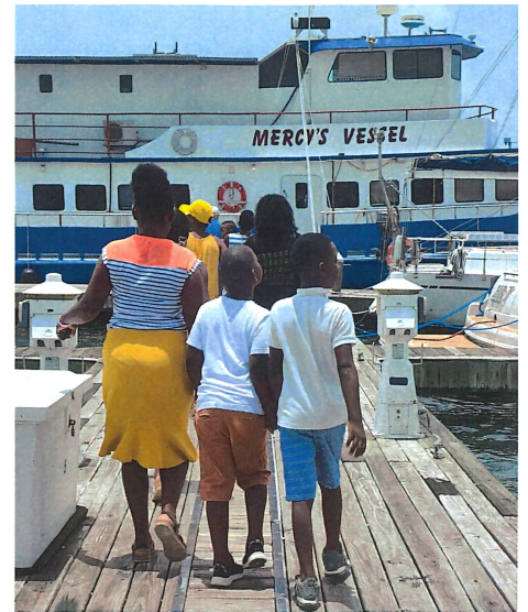
Pictured above are the very first patients on Mercy's Vessel in the Dominican Republic, May 2022.

ously. . . "Where there is no vision , the people perish. . ." Proverbs 29:18.